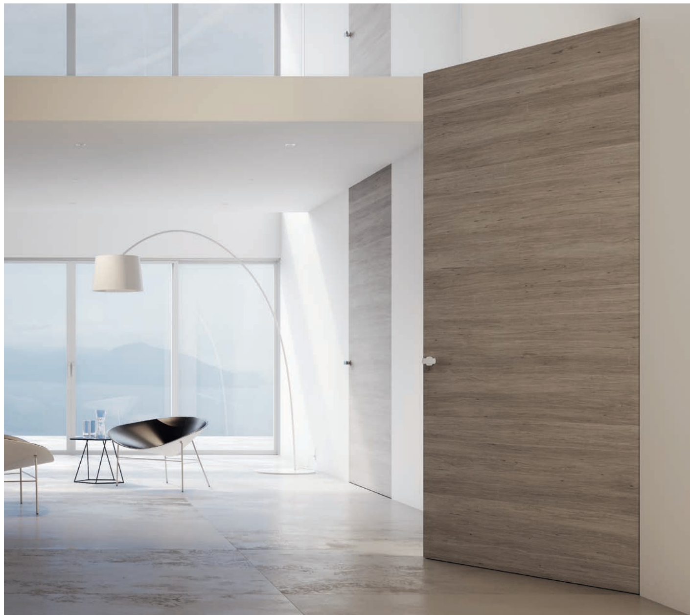
Alba FILO 5 HINGED DOOR Wood veneer finish, horizontal vein. Luxury villa. Vancouver, Canada.