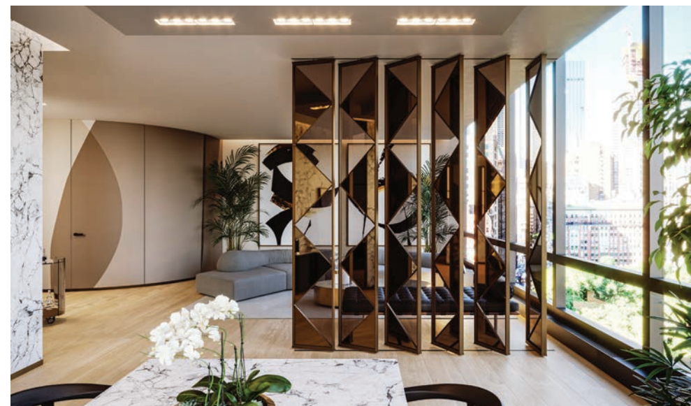
Brezza FLY ZEFIRO SYSTEM Framed version. Clear glass and bronze effect mirror finishes. Anodized aluminium frame. Penthouse. New York, USA.