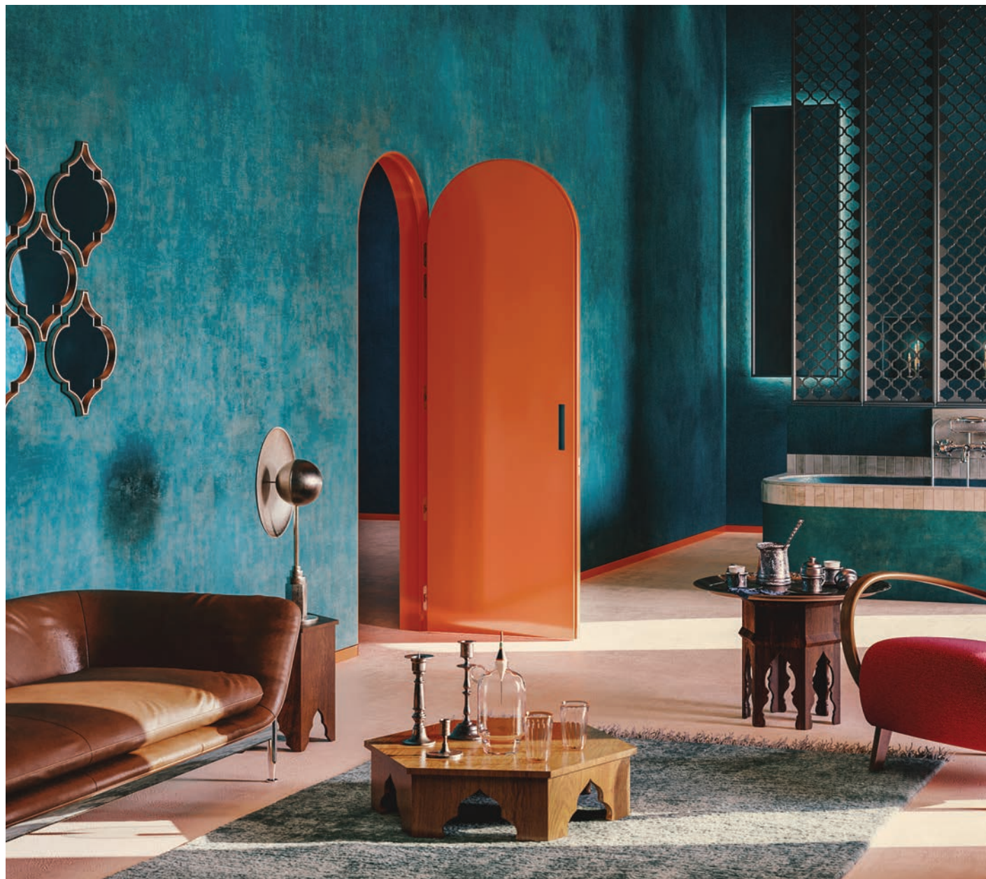
Alba ARCHED HINGED DOOR Glossy lacquered and painted as wall finishes. Flush recessed handle. Private residence. Manama, Bahrain.