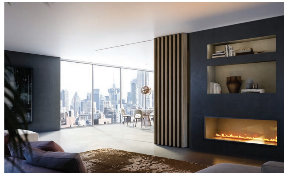
Brezza FLY ZEFIRO SYSTEM Wood base panel version. Wood veneer finish with see-through motif. Penthouse. London, UK.