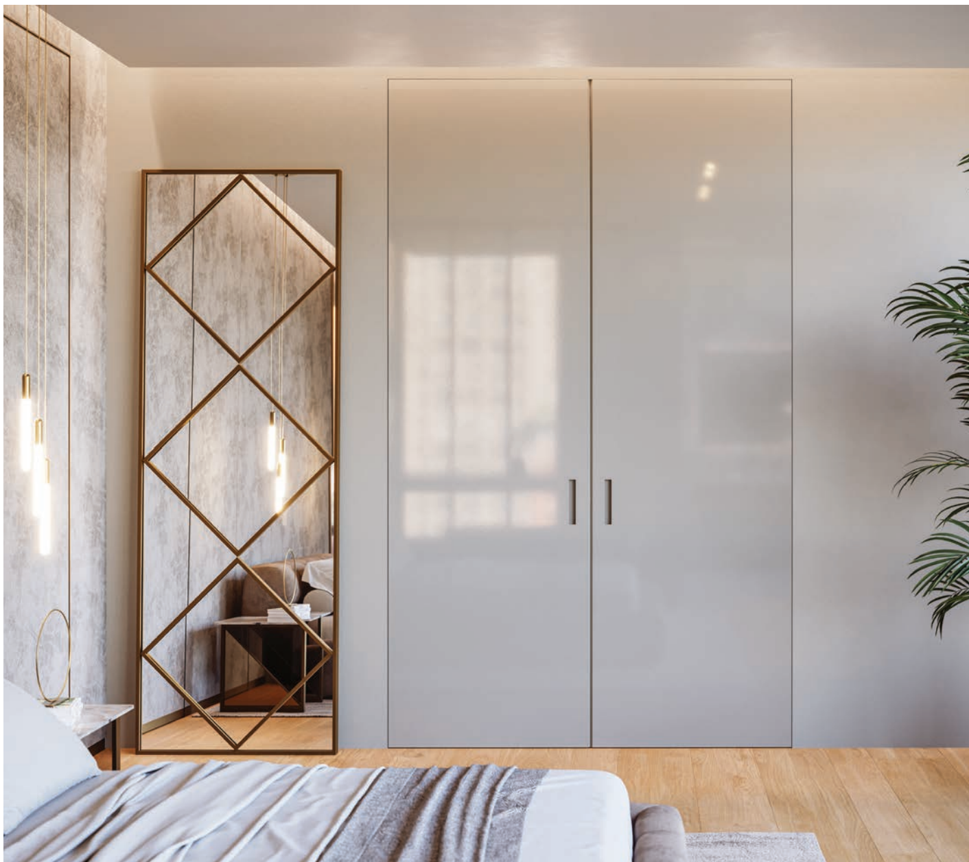
Marea CONCEALED SLIDING DOOR Double leaves manual version. Glossy lacquered finish. Flush recessed handle.