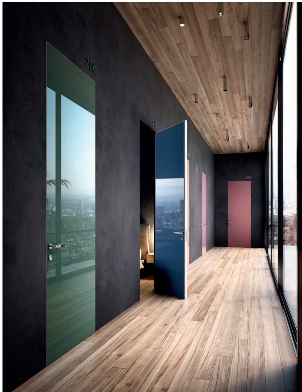
Alba INFINITO 5 HINGED DOOR Coloured back lacquered glass finish. Anodized aluminium frame. Luxury hotel. Rome, Italy.