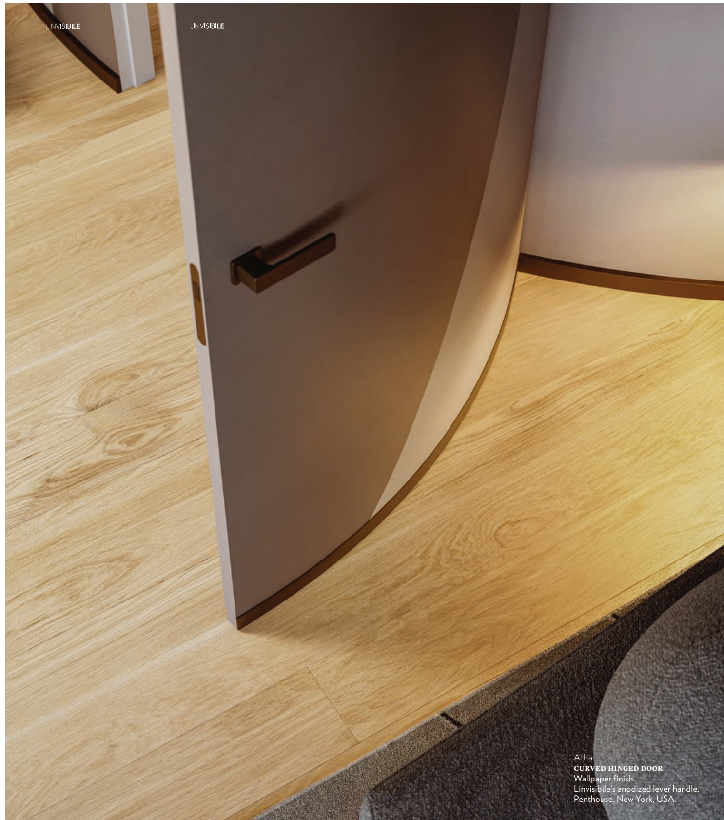
Alba CURVED HINGED DOOR Wallpaper finish. Linvisible's anodized lever handle. Penthouse. New York, USA.