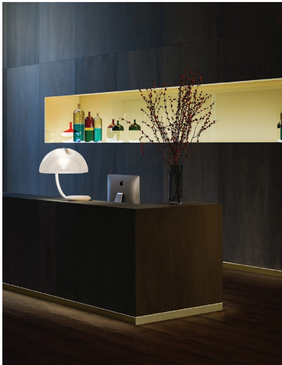
Orizzonte SKIRTING SYSTEM Linvisibile anodized finish. LED lighting. Luxury hotel. Shanghai, China.