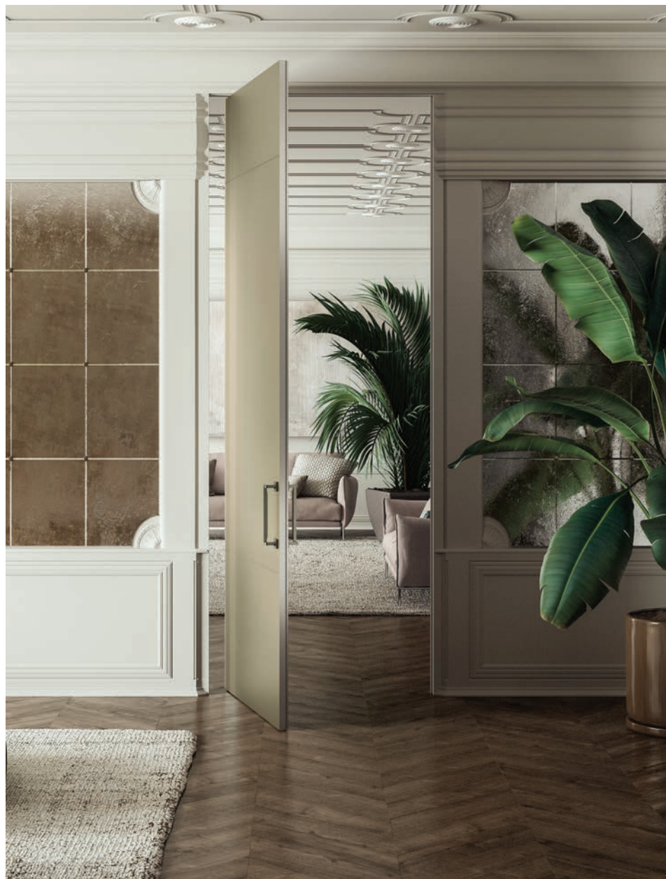
Brezza INFINITO 5 VERTICAL PIVOT DOOR Laminate finish. Anodized aluminium frame. Luxury villa. Melbourne, Australia.