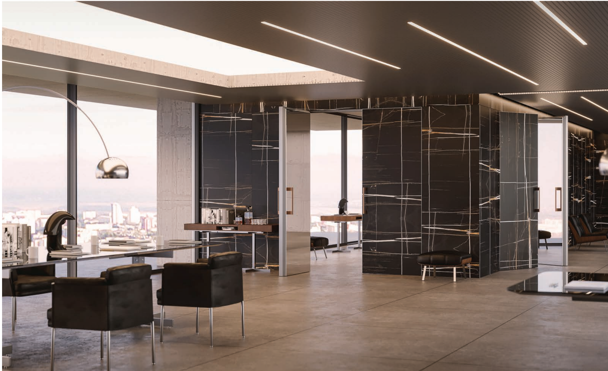
Alba INFINITO 10 HINGED DOOR Double leaves version. Ceramic and mirror finishes. Anodized aluminium frame. Offices. Denver, USA.