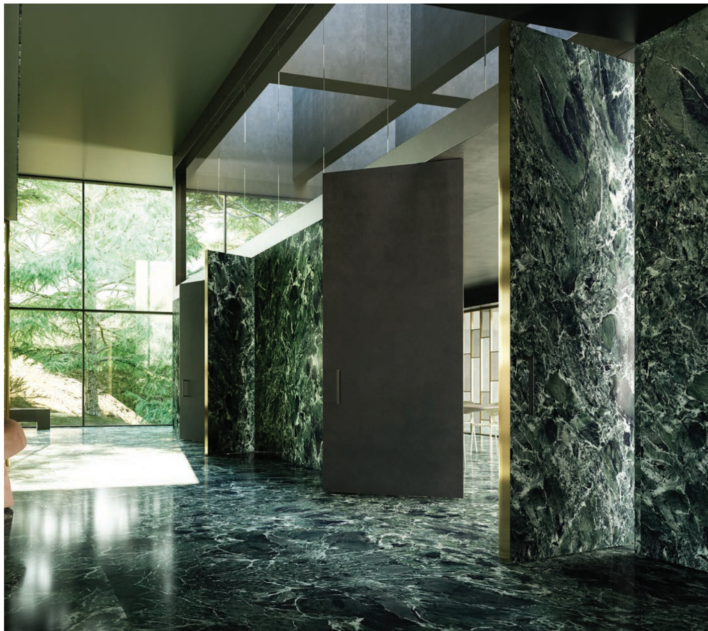
Brezza INFINITO 10 VERTICAL PIVOT DOOR Double leaves version. Ceramic finish on both sides. Anodized aluminium frame. Luxury hotel. Oslo, Norway.