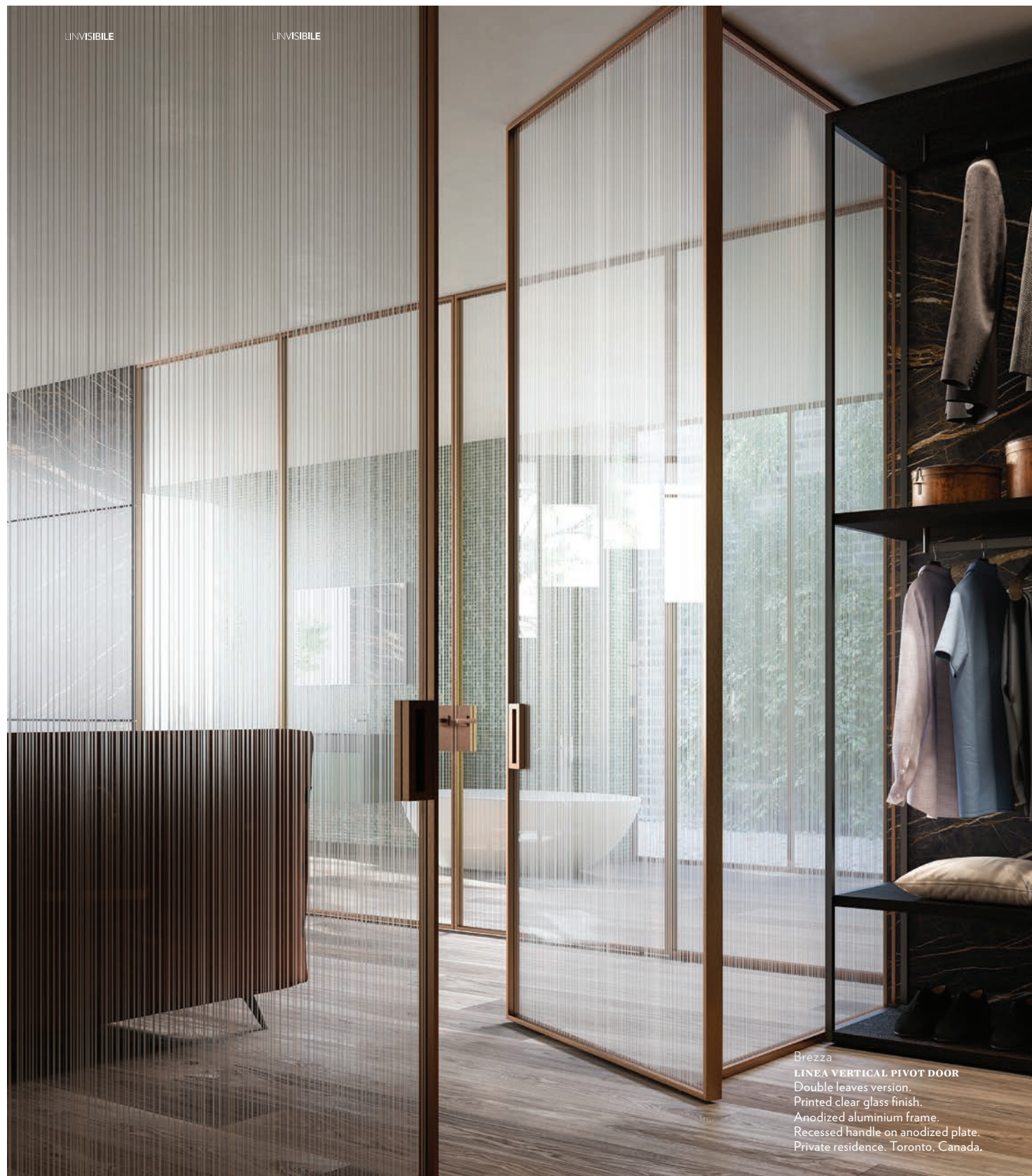
Brezza LINEA VERTICAL PIVOT DOOR Double leaves version. Printed clear glass finish. Anodized aluminium frame. Recessed handle on anodized plate. Private residence, Toronto, Canada.