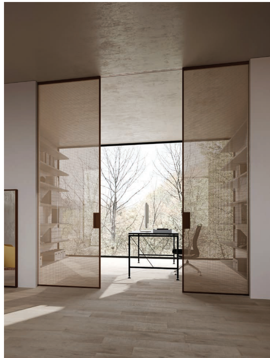
Marea LINEA POCKET DOOR Double leaves version. Clear glass with mesh finish. Anodized aluminium frame. Recessed handle on anodized plate. Luxury villa. St. Petersburg, Russia.