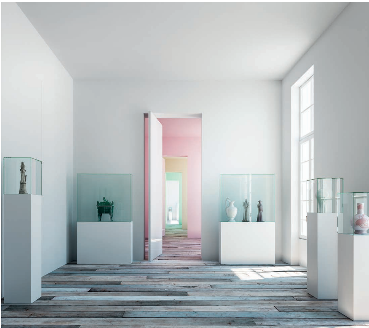
Brezza FILO 5 VERTICAL PIVOT DOOR Lacquered finish. Matt effect. Museum. St. Petersburg, Russia.