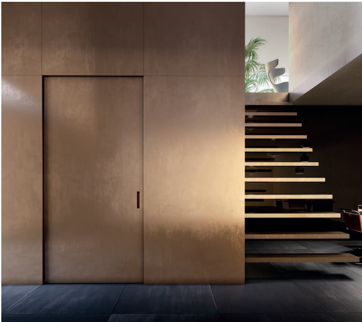
Marea POCKET DOOR Metal copper finish. Flush recessed handle. Private residence. Los Angeles, USA.