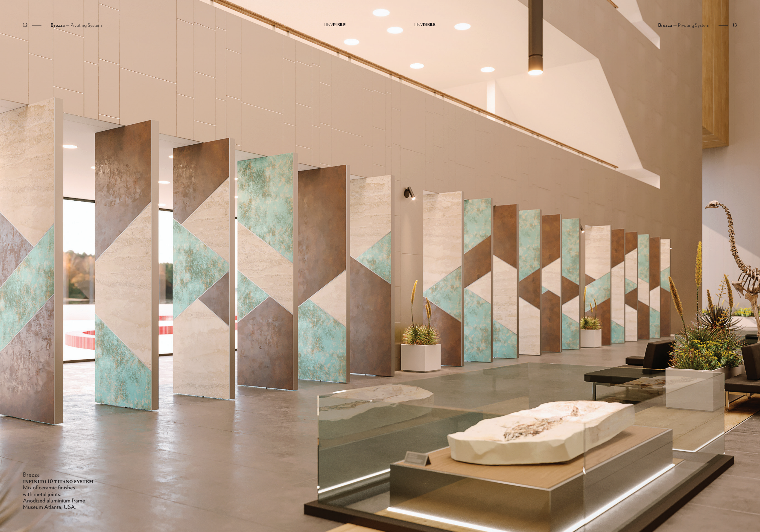
Brezza INFINITO 10 TITANO SYSTEM Mix of ceramic finishes with metal joints. Anodized aluminium frame. Museum Atlanta, USA.