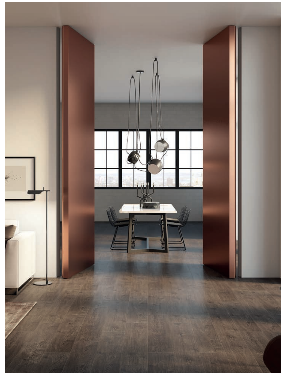
Brezza FILO 10 VERTICAL PIVOT DOOR Double leaves version. Metal copper finish, matt surface. Private residence. Los Angeles, USA.