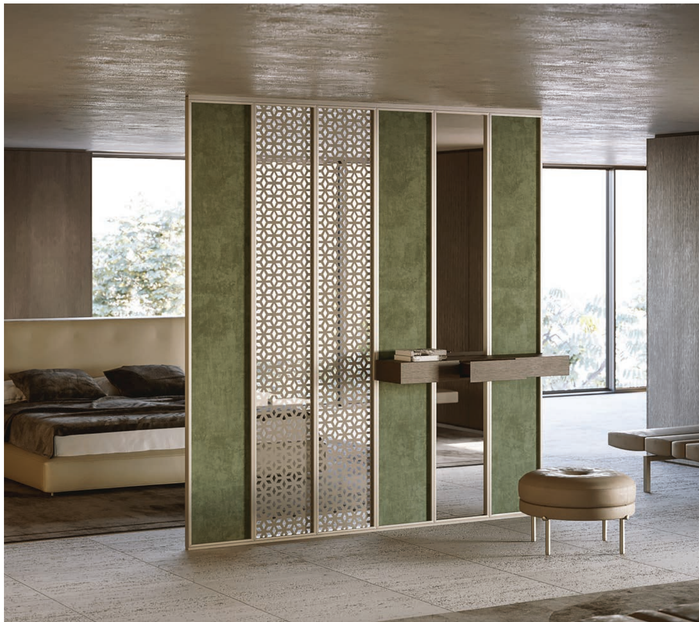
Orizzonte MAESTRALE SYSTEM Fabric and designer anodized perforated metal finishes. Anodized aluminium frame. Suspended console, wood essence finish. Private residence. Courmayeur, Italy.