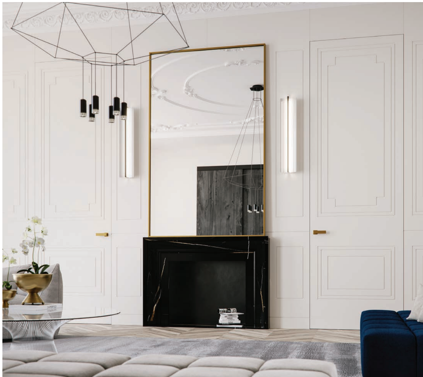
Orizzonte FURNISHINGS Mirror. Anodized aluminium frame.