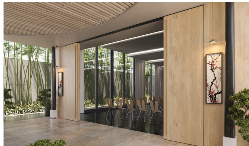
Marea MODULAR SLIDING SYSTEM Multiple leaves, two fixed and four telescopic mobile panels. Wood essence finish. Recessed handle on project. Conference centre. Sapporo, Japan.