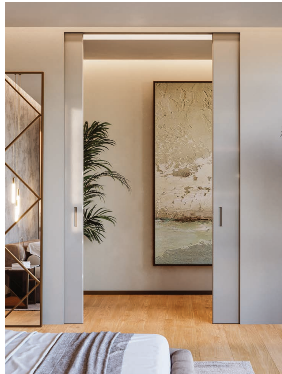
Orizzonte FURNISHINGS Mirror with custom pattern composition. Anodized aluminium frame. Penthouse. New York, USA.