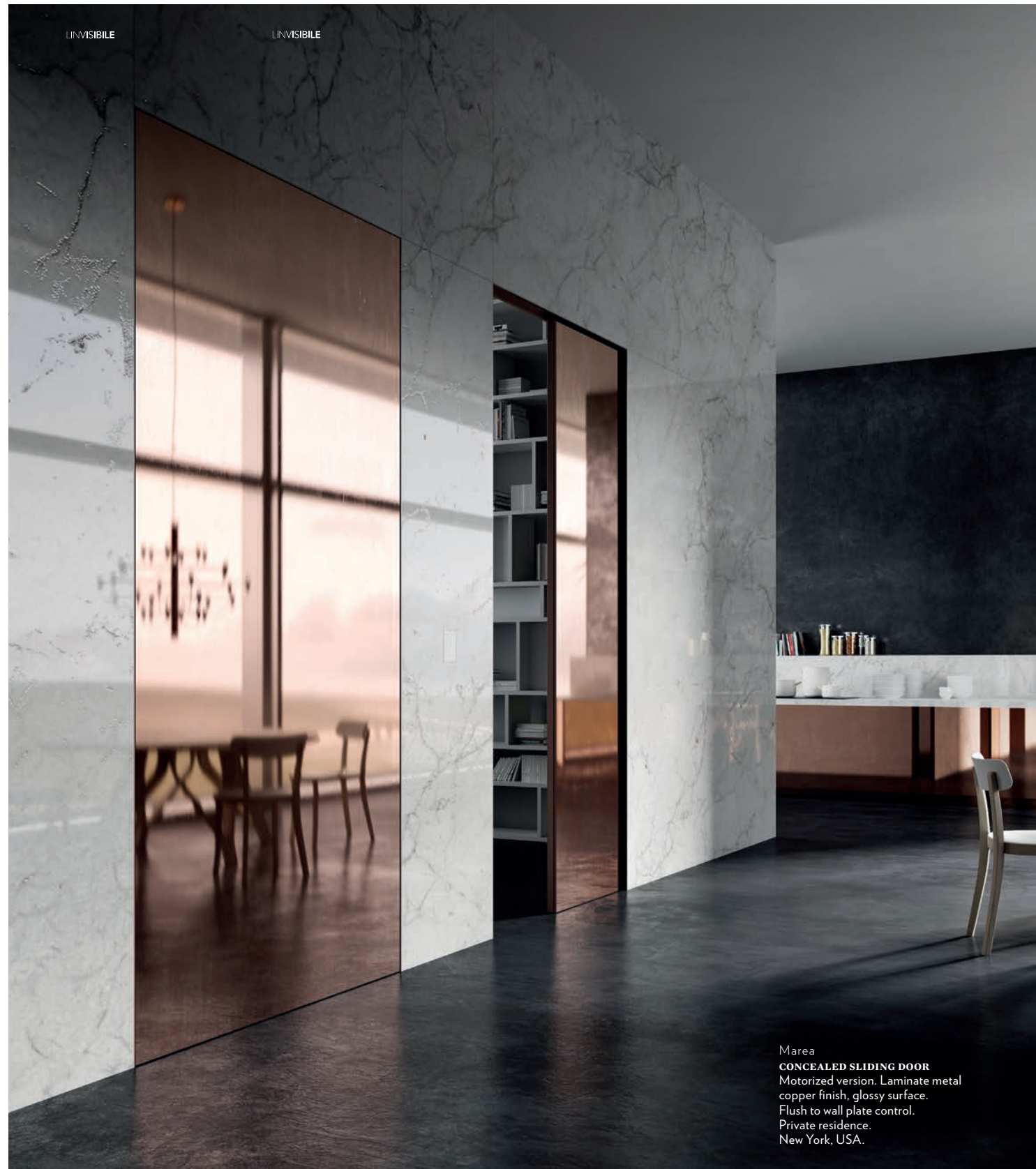
Marea CONCEALED SLIDING DOOR Motorized version. Laminate metal copper finish, glossy surface. Flush to wall plate control. Private residence. New York, USA.