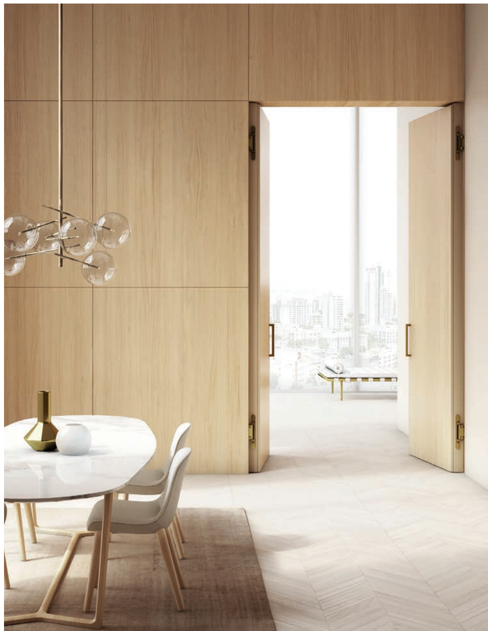
Alba FILO 10 HINGED DOOR Double leaves version. Wood essence finish.