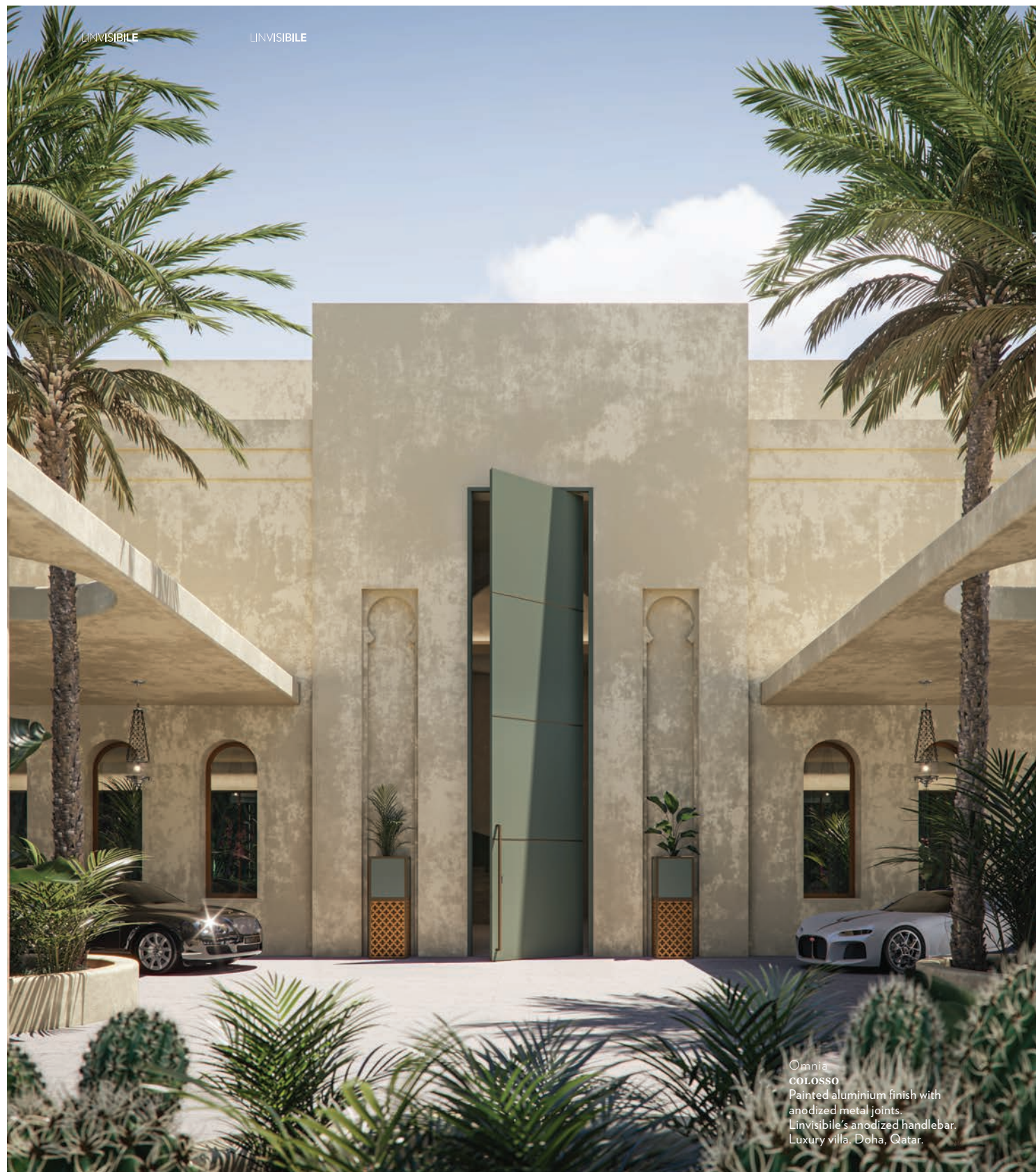
Omnia COLOSSO Painted aluminium finish with anodized metal joints. Linvisibile's anodized handlebar. Luxury villa, Doha, Qatar.