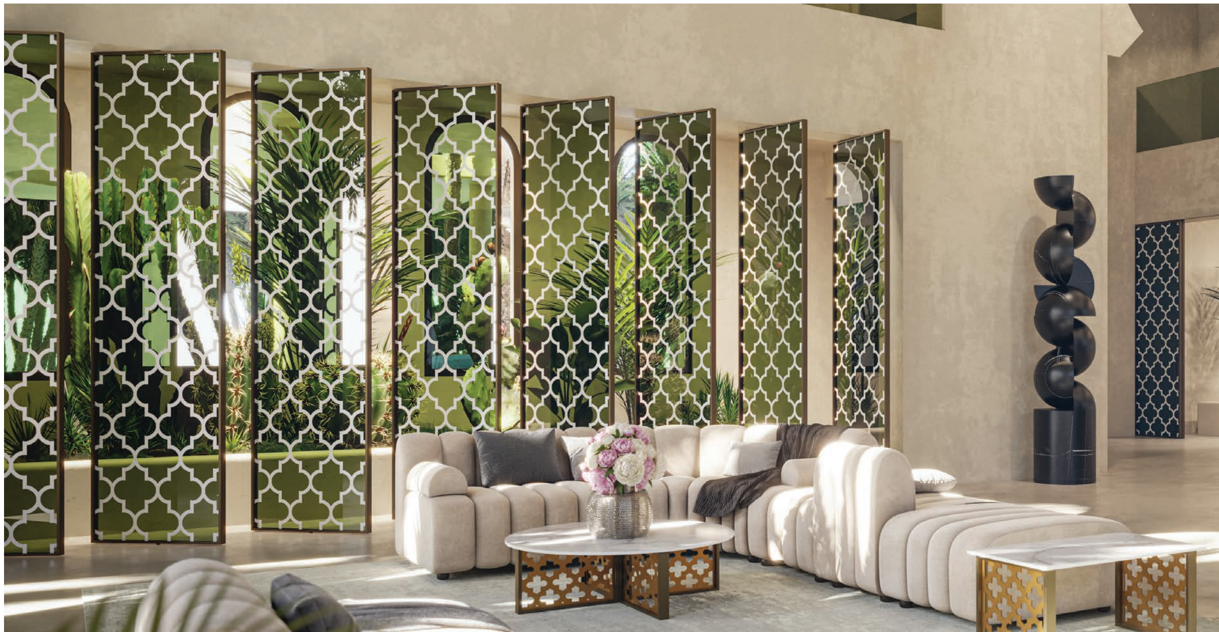
Brezza LINEA TITANO SYSTEM Printed clear glass finish. Anodized aluminium frame.